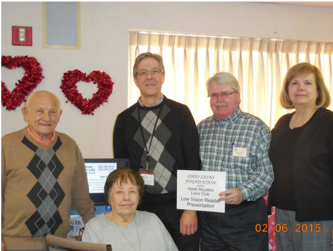
02-06-2015LOW VISION READER DONATION to NORTH ROYALTON OFFICE on AGING